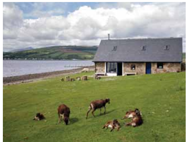
Clockwise from top left: wild pony; view from interior at the Holy Island Project; sheep by the visitor centre; stained glass; cormorant and curious seal.