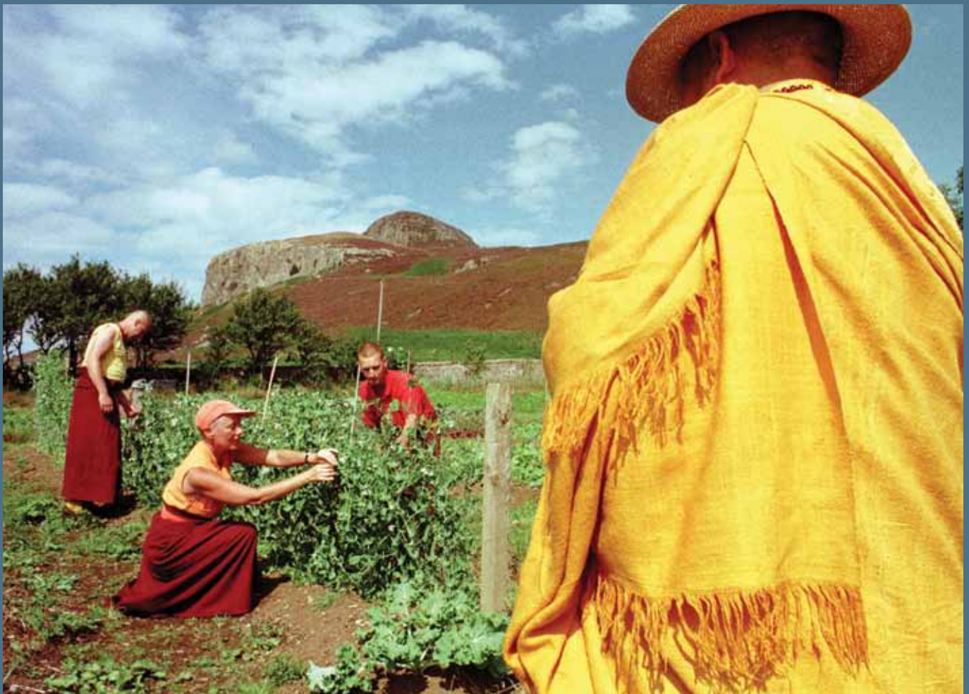
Top right: Holy Island seen from the Isle of Arran and above: Buddhists monks tend their garden on the island.

Step on board the Dualist. Enjoy a leisurely sail with 360° views en route to the beautiful Holy Isle owned by Tibetan Buddhists. Breathe in the peace and natural beauty of this landscape and discover what attracts multi-faith volunteers to this special island.